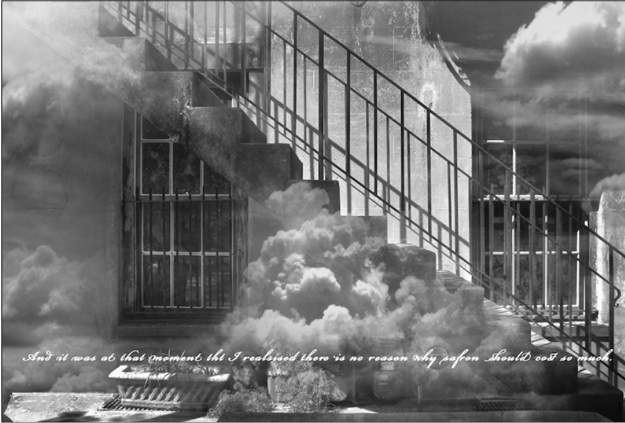
Saffron Clouds —Black & white print by Paul Jaffe